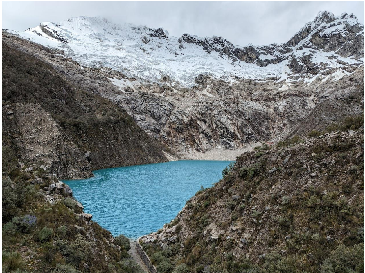
Team hike to Laguna Hualcacochoa (14,288 feet)